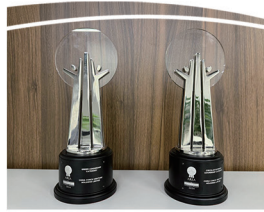
31 October 2024

Yangzhou Haichang Port under the Company launched its external opening service function, and successfully received the first international navigation ship for berthing and operation on 14 October.