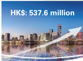
22 August 2024

The Company hosted the event "Entrepreneurial Classroom Entering Conch Venture", and more than 140 enterprises in Wuhu signed up to participate.