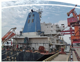
20 August 2024

Yangzhou Haichang Port under the Company launched its external opening service function, and successfully received the first international navigation ship for berthing and operation on 14 October.